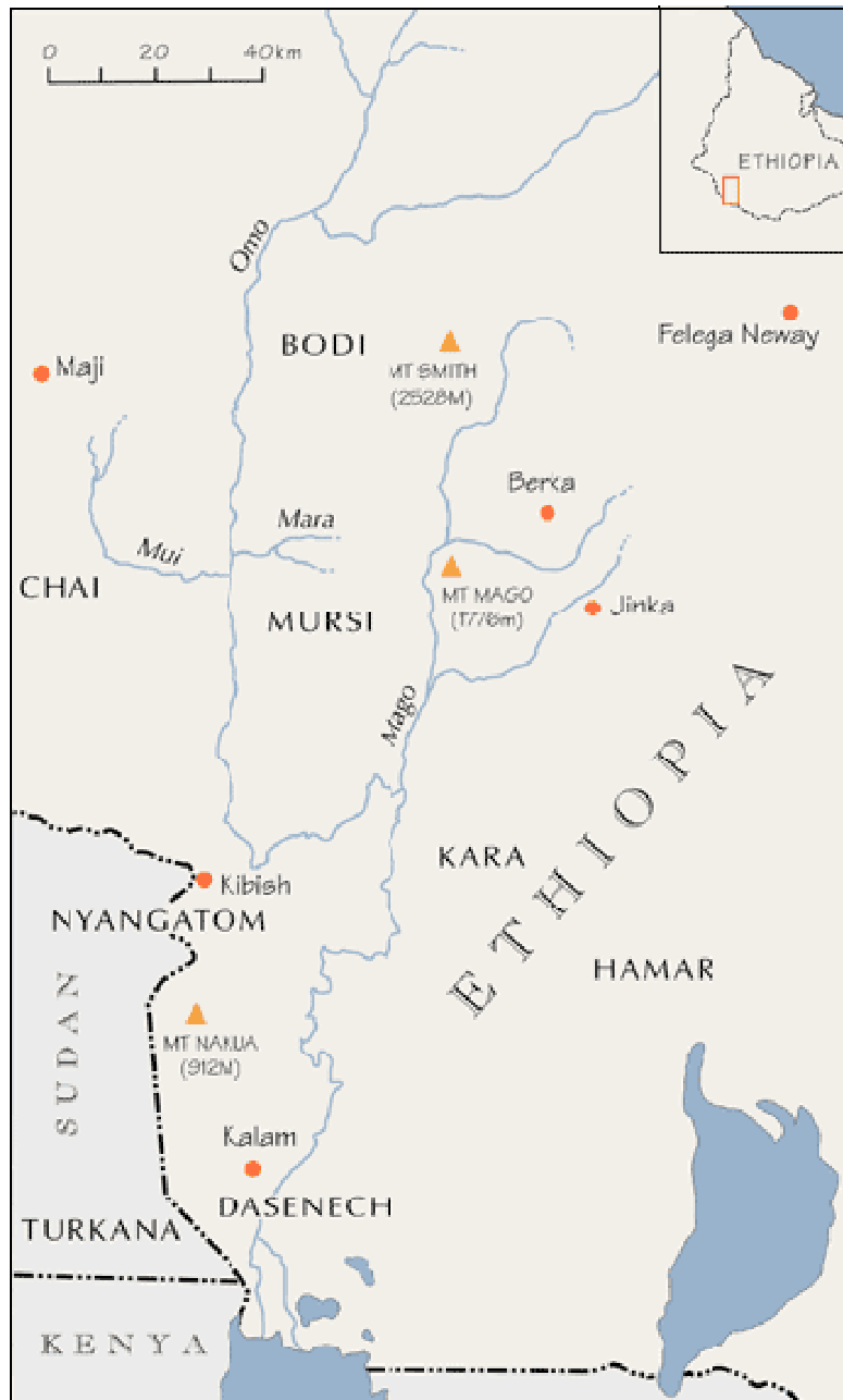
1. Figure: A map of the Lower Omo Valley