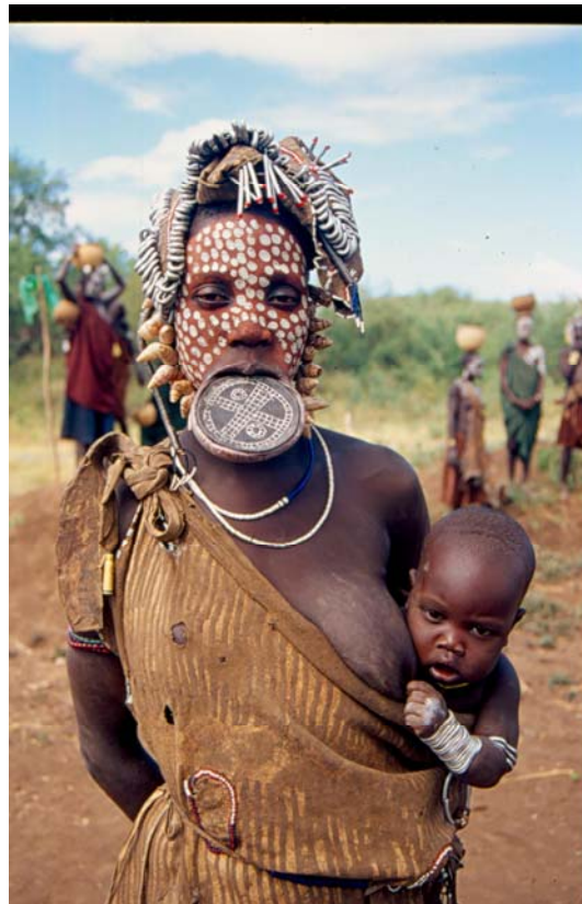
Figure 3 A Mursi woman waiting for tourists in Solbu (see online version for colours)

without taking pictures or asked their guide to leave the village. However, the Mursi were also disappointed in this instance: they did not accept the idea that the tourists could not afford to pay the sum that they wanted. They perceived this form of commerce as completely acceptable. Consequently, both parties had unfulfilled expectations. This caused frustration on both sides but the situation remained the same. From July to November, the number of visitors to the Mago National Park increases and Mursi settlements are quickly set up along the roadside in response. New huts are constructed increasingly close to the checkpoint in order to catch tourist cars before they enter other settlements. In an interview with a Mursi man in July 2011, I was told that five new settlements had been set up before the Mago Bridge which accommodated an increasing number of tourist encounters on a daily basis.